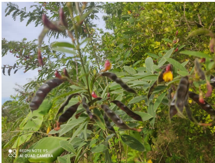
Updates from the gardens- Congo beans at the gardens around the school, some are ready and others blooming.