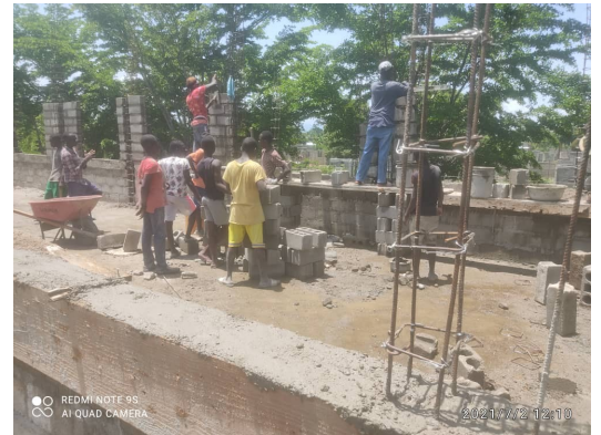
Construction Project at the school complex.