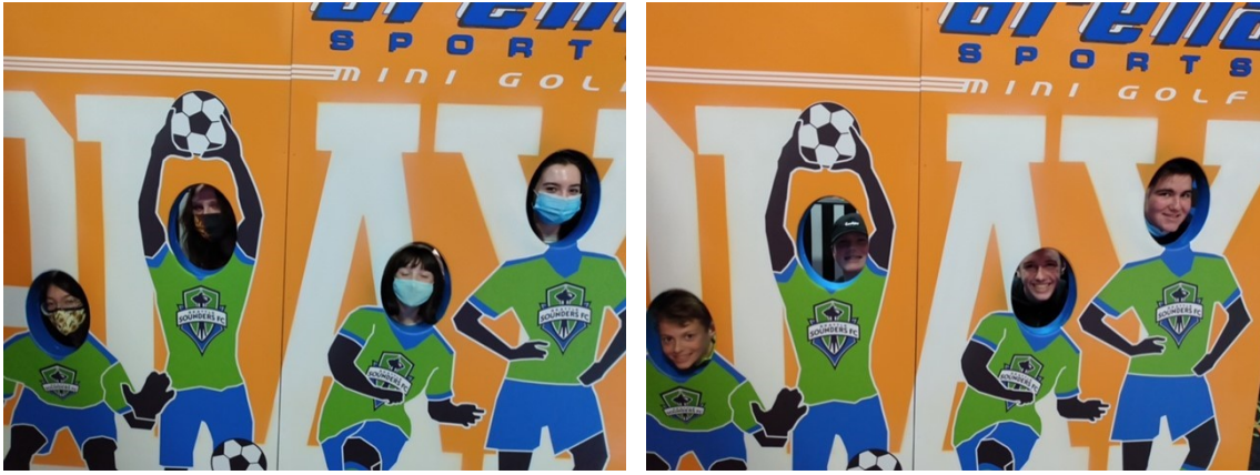
Fun times last month at Arena Sports and Bob's Corn!