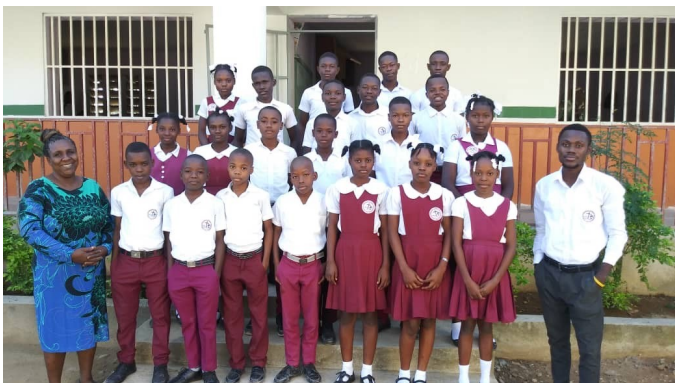
A couple of the class at the school.