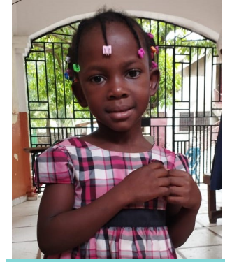
Experience the blessing of sharing the gospel with children in Haiti. Sponsor a student, an orphan, or a class.