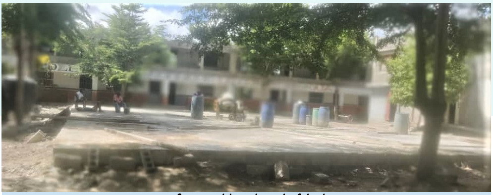
Concrete slab work at the School

We thank you for your gifts. As we reach the end of year, we ask you to prayerfully consider a gift to NEHLM. The board has designated year-end giving to offset the increases in feeding costs.